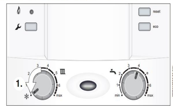
Fig. 3 Switch off central heating

1. Turn the temperature control knob to the snowflake symbol to switch off the central heating.