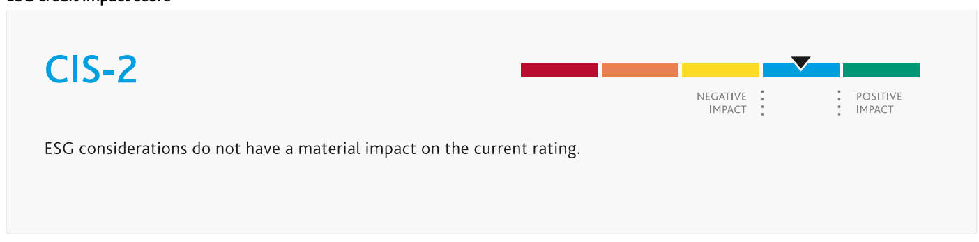
Exhibit 3 ESG credit impact score

Bromford Housing Group Limited's ESG credit impact score is CIS-2