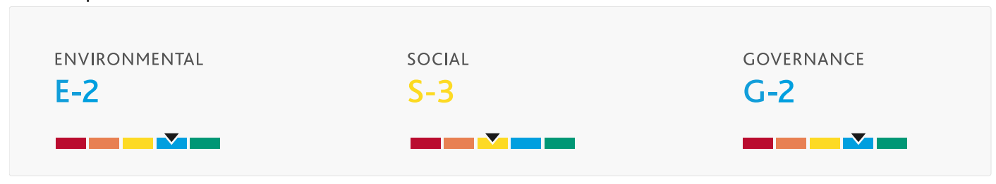
Exhibit 4 ESG issuer profile scores