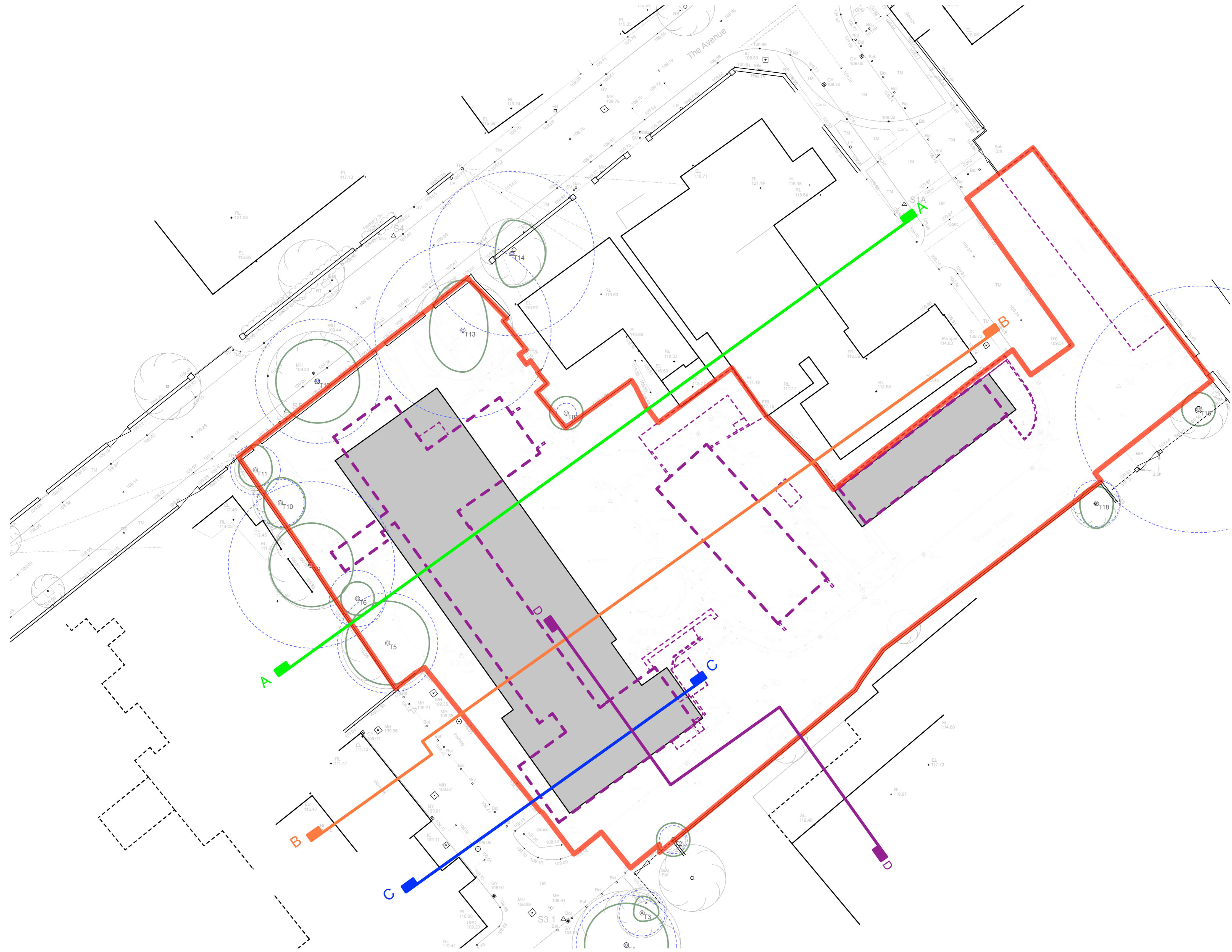
Footprint Comparison Plan (1:250)