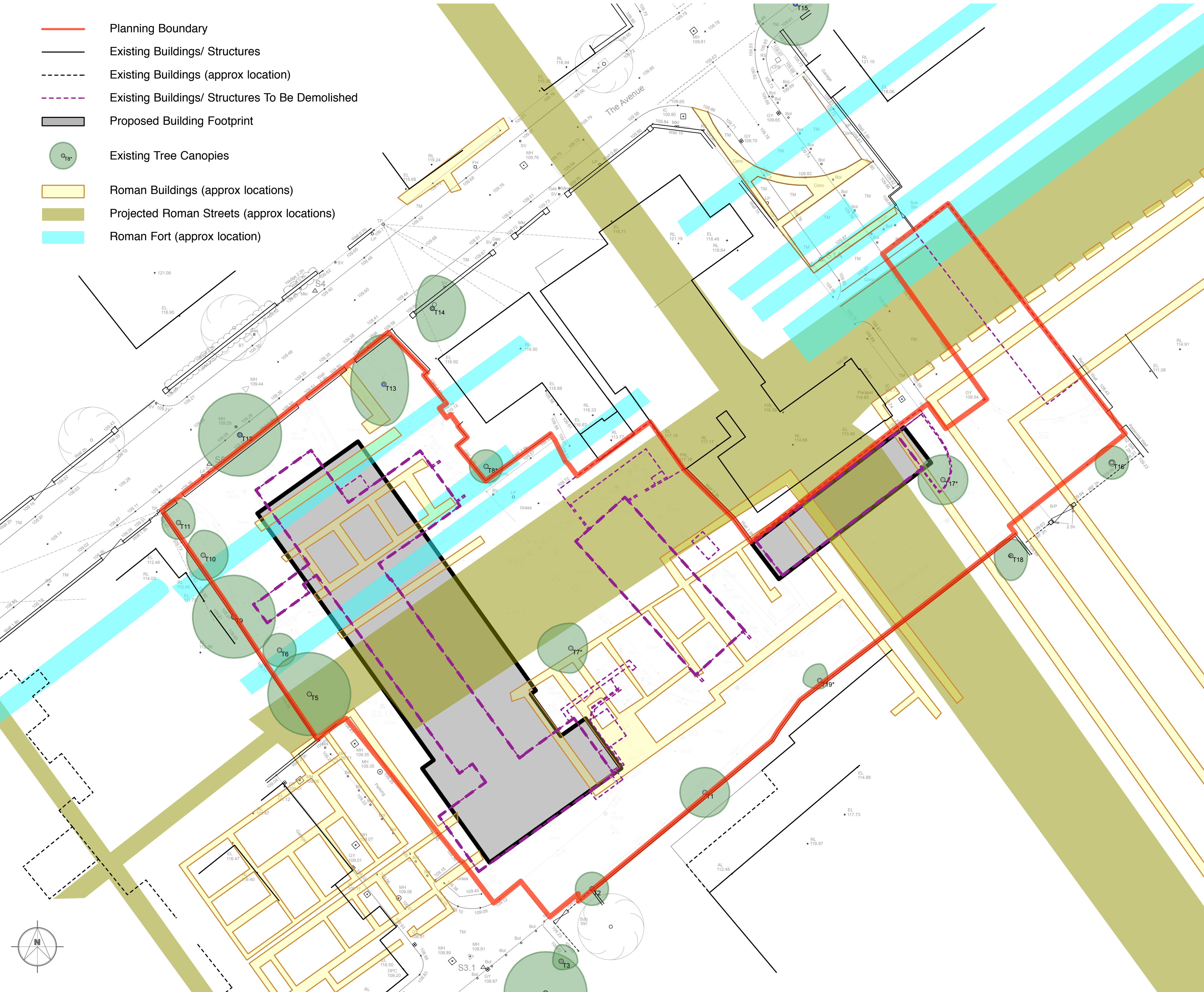
Archaeology Assessment Plan (1:250)